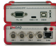
microUniDAQ.IEPE for IEPE sensors